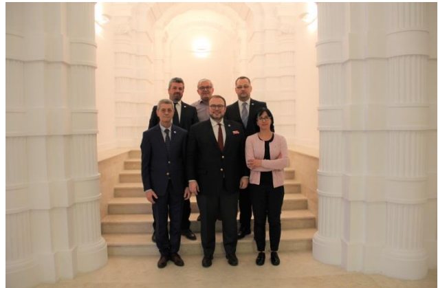
The President and some of those present pose at the entrance of the historic hotel where the GAM was held.

Please note that our next General Assembly Meeting will take place in Zagreb on the 26 th of November at the kind invitation of our Croatian member HKMS.