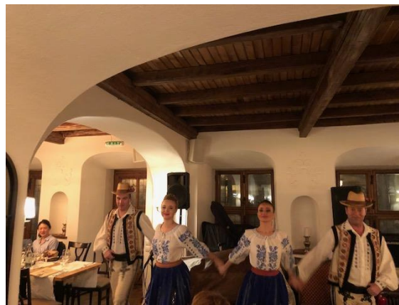
At the kind invitation of OAMR (Romania), most members-delegates had a lovely dinner in a traditional restaurant in one of the most picturesque neighborhoods of the city.